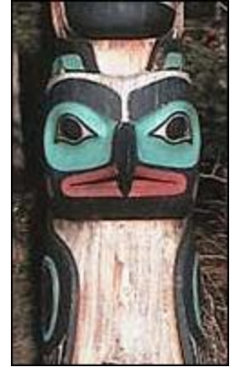
Figure 4 - Haida Totem Pole

symbols are carved into cedar trees to create totem poles. The totem pole is another iconic piece of artwork from the Haida tribe, but was also utilized and created by other Pacific Northwest native tribes. The totem poles were often referred to as “monumental poles” (Totem Poles) and were placed in doorways of houses, carved into support beams of homes or as freestanding memorials for deceased honored members of the society. Early totem poles were likened to billboards, often signaling the presence of rich and powerful