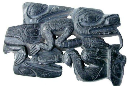
Figure 5 - Argillite Carving

Traditionally, argillite was carved into pipes, bowls and small sculptures which were popular trade items after European contact (see Fig. 5). Today most argillite takes the form of jewelry, but this was not a historically popular way of using the stone (Ventura). Designs carved into the stone are based on the Haida oral traditions and myths. Common themes are, of course, the Eagle or Raven moieties. Bill Reid, a Haida tribal member, was a famous and skilled artist of both totem poles and argillite carvings. He is considered to be the greatest influence in introducing the world to the art of the Pacific Northwest (Bill Reid Foundation).