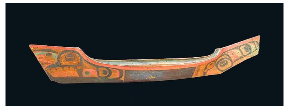
Figure 2 – A model of a traditional war canoe.

themselves as traders and craftsmen- an economic