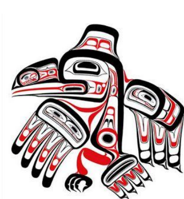
Figure 3 - Haida Raven

Haida subsistence strategies in modern years have become intertwined with tribal artwork. The Haida style of art is iconic and internationally known. Today, traditional artwork is often made specifically to be sold to tourist markets, providing an income to families and towns.